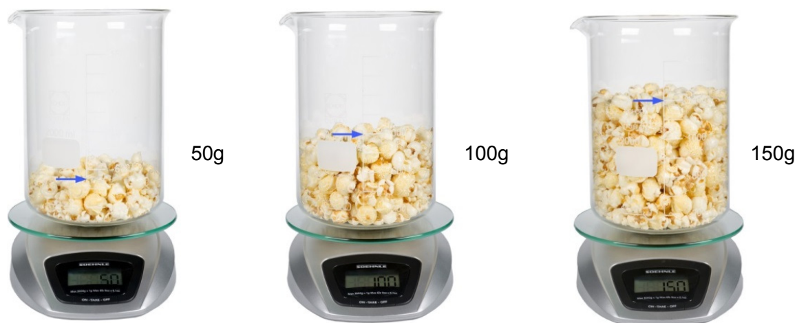
Figure 1: Portion sizes of 50 g, 100 g and 150 g of popcorn

Consumption amounts for popcorn could be determined from the provisional consumption data, by screening the already electronically recorded KiESEL dietary records, of which some will be described below. The consumption of a 100 g pack in the cinema has been recorded for a 3-year-old individual. A 2-year-old child consumed 50 g of popcorn at home, this quantity was weighed with the KiESEL scales. Another 2-year-old child consumed 100 g of popcorn during a carnival parade. The consumption of 69 g of sweet popcorn during a cinema visit has been recorded for a 4-year-old child. This current data shows that a popcorn consumption of up to 100 g is realistic for the age group in question.